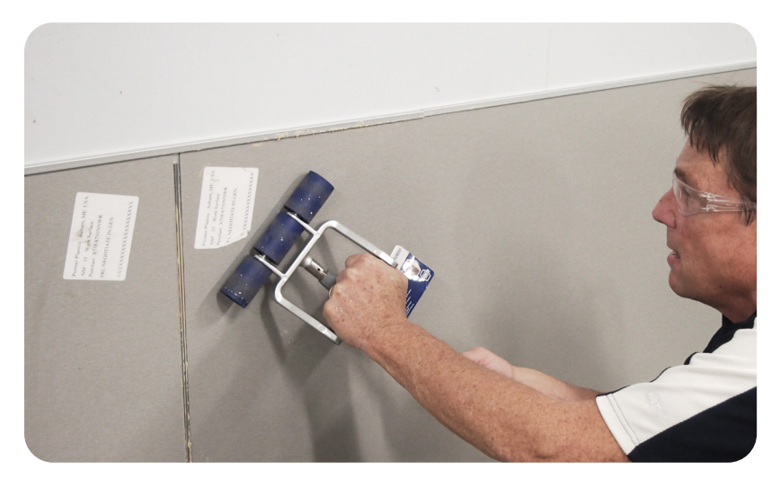
Roll with D-handle laminate roller.