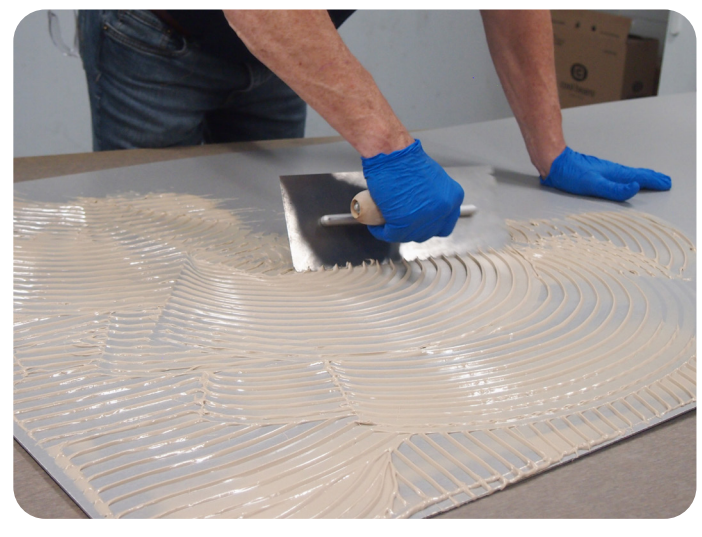
Use crosshatch method close to edge as shown in image above.