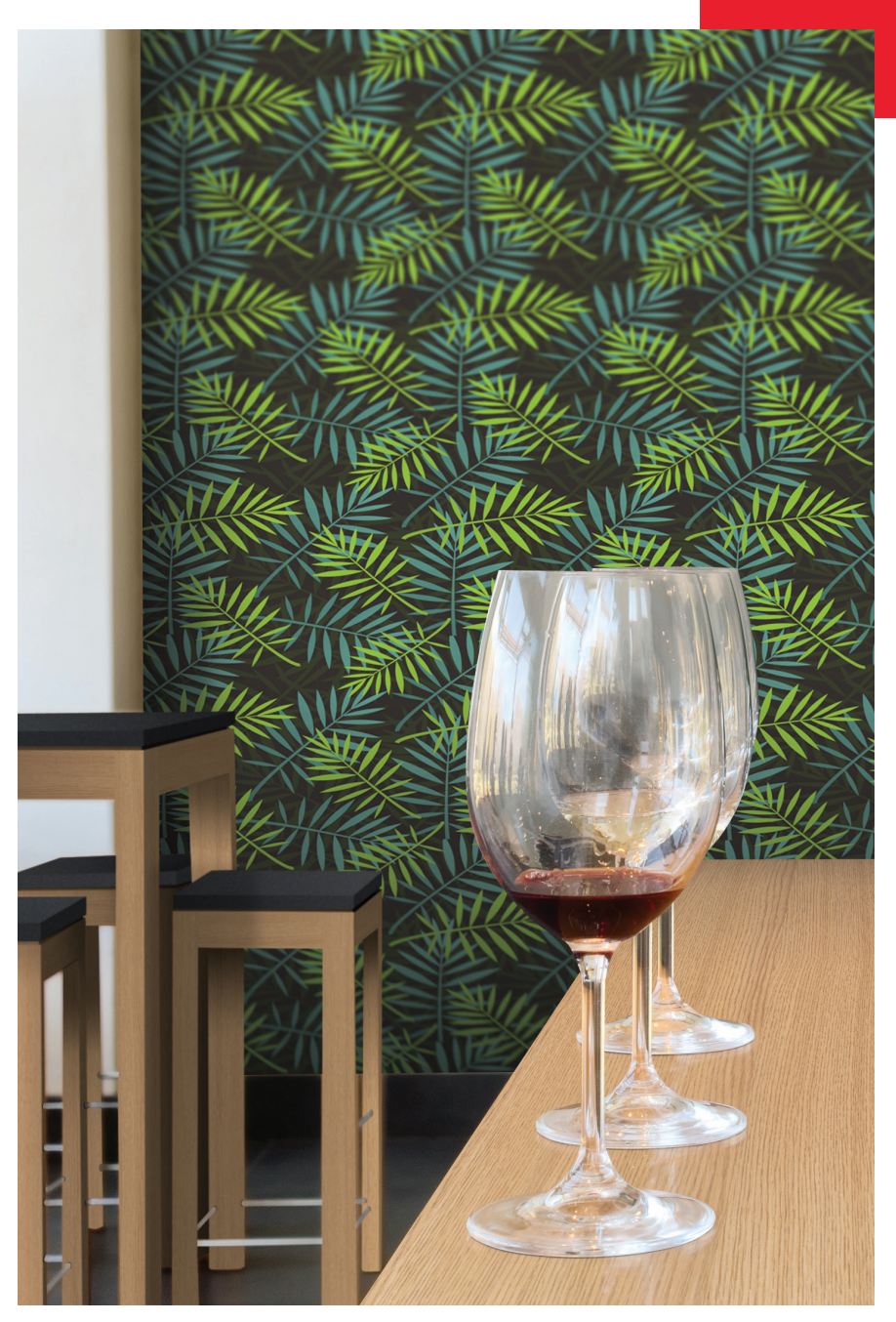
Digital graphics used to create a feature wall can set the atmosphere in hospitality settings.

When your design must be big, bold and beautiful, we've got you covered.