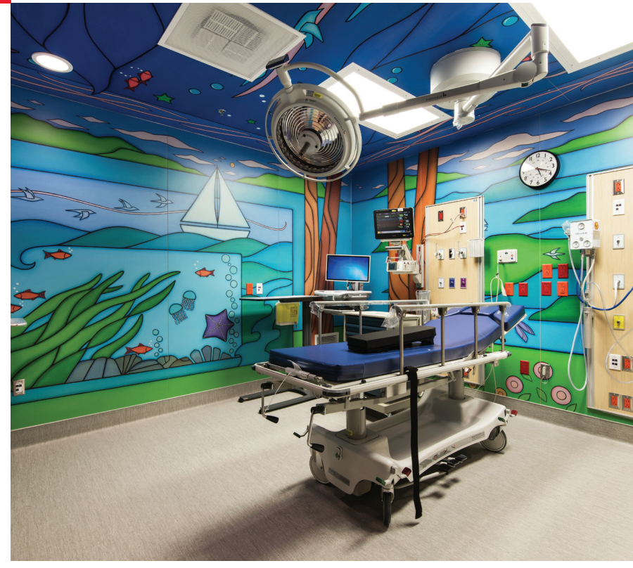
Custom digital graphics in a healthcare environment create a more relaxed experience for the patient.

Wall murals can bring life to a hallway or assist in wayfinding.