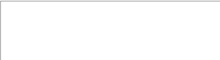
White Diamond SW8900 ST

Get a stylish look with these five stunning colors: